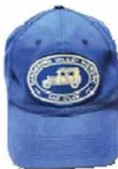
CLUB CAP $9