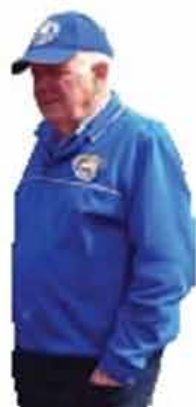
WIND CHEATER $40