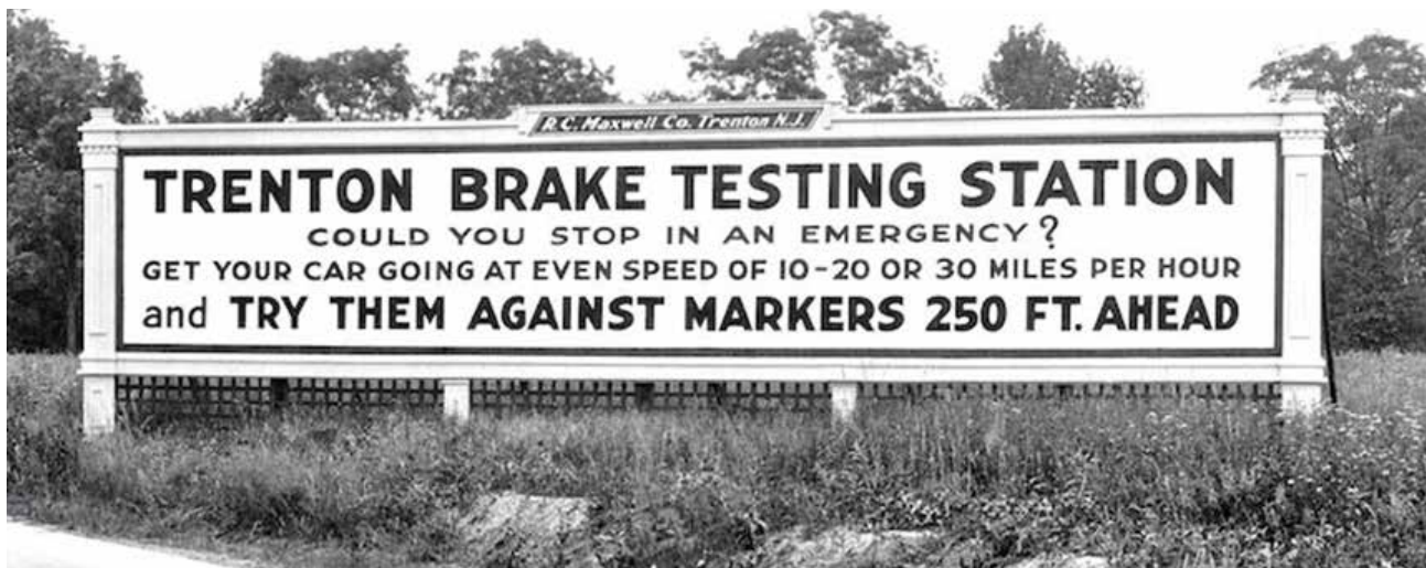
Brake Testing Station billboards photographed on June 28, 1923, on Lawrenceville Road, Trenton NJ.