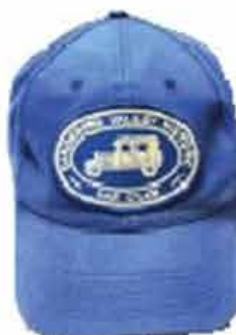
CLUB CAP $9