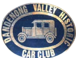
DECAL STICKER $1