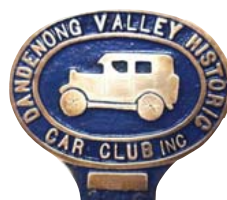
BUMPER BADGE $21