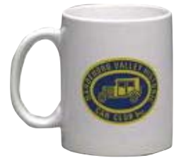
CLUB MUG $9