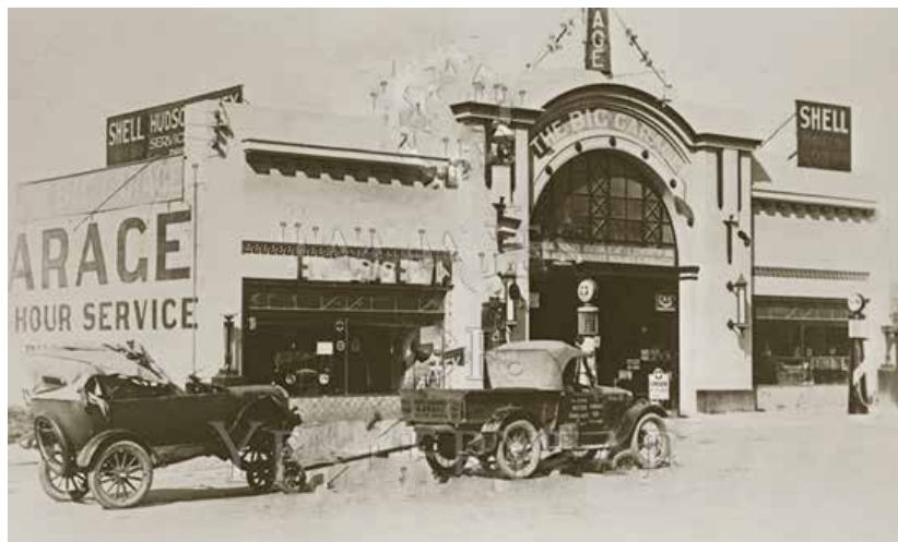
The Big Garage Bairnsdale with my 1915 Weaver Auto Ambulance bringing in a Model T Ford which had come to grief around 1929. The tow vehicle is a 1924 Studebaker. ..ED