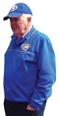
WIND CHEATER $40