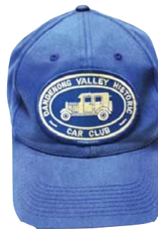
CLUB CAP $9