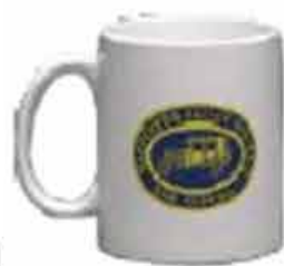
CLUB MUG $9