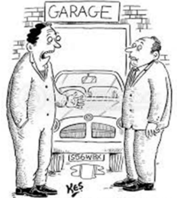
"The only service I could give this would be a funeral service."