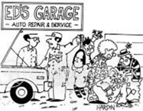
"You got clowns in your engine-That's what's making them funny noises!"