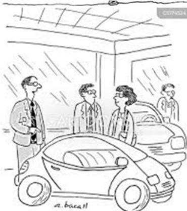
"This electric car is environmentally friendly and will bring your family closer together."