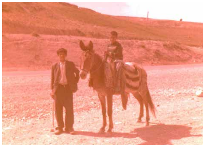
Pleasure Time - Donkey Ride, Owner's son.

Unfortunately, many of my photos from now on were heat affected like the one on right.