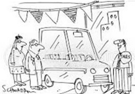
"IT GOES FROM $40,000 TO ZERO IN 72 EASY PAYMENTS."