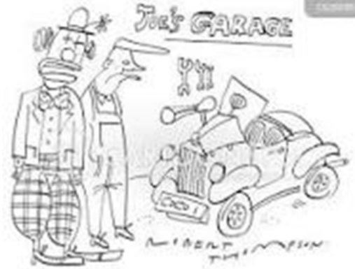
"There's something wrong with it, it won't backfire and the wheels don't fall off."