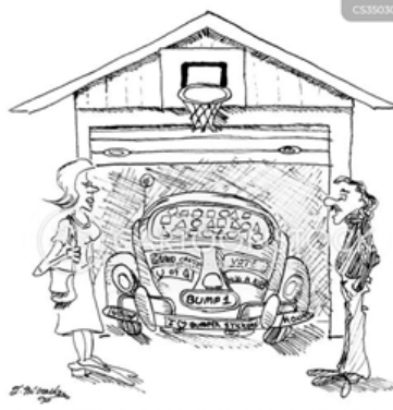
"I KNOW WE HADN'T PLANNED ON GETTING A BIGGER CAR UNTIL WE HAD KIDS, BUT I THINK WE NEED ONE NOW TO ACCOMMODATE THE RIMPPR-CTUCKER."