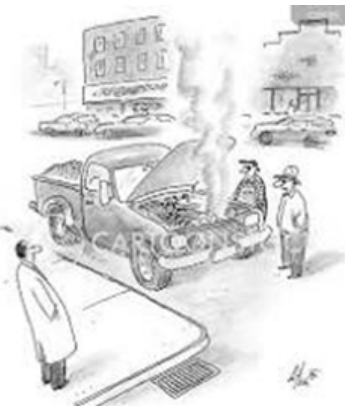
"Perhaps I can help, gentlemen. I am a rocket scientist."