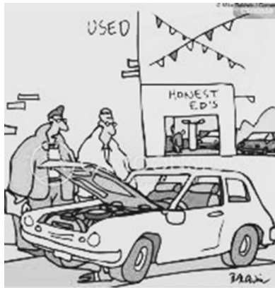
"We stand behind all our vehicles. Sometimes we even help push."