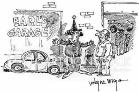
"MY FUNNY LITTLE CAR IS MAKING FUNNY LITTLE NOISES."