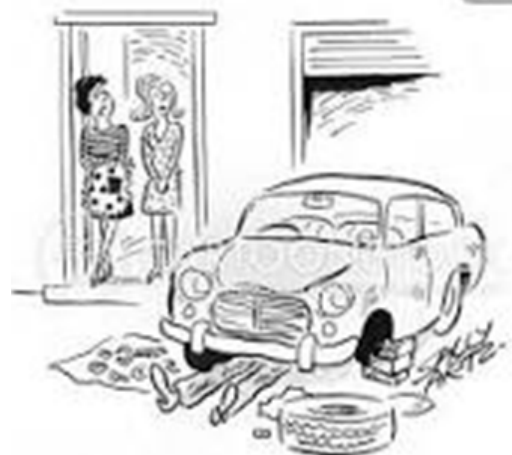
"I'll say this for it - it keeps him out of the house."