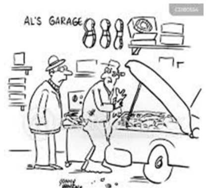
"We'll have to check your car for pre-existing conditions."