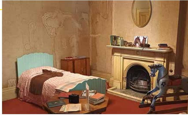
A child's bedroom with books and a rocking horse