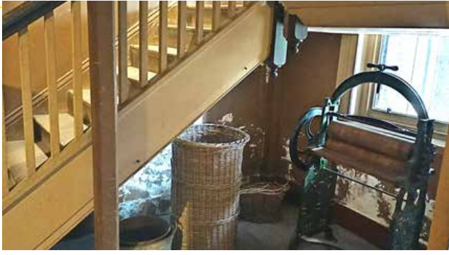
How many fingers have been squashed in a mangle.