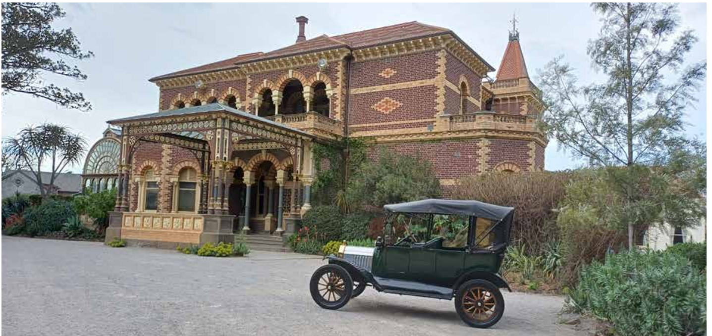
Graeme C, was lucky enough to get a photo of his Model T Ford in pride of place.