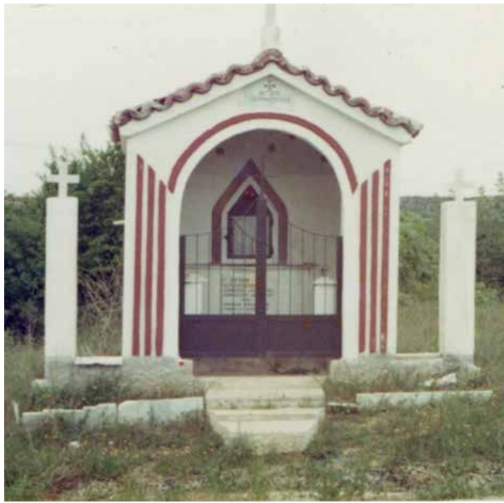
One of the many shrines along the road in Yugoslavia.