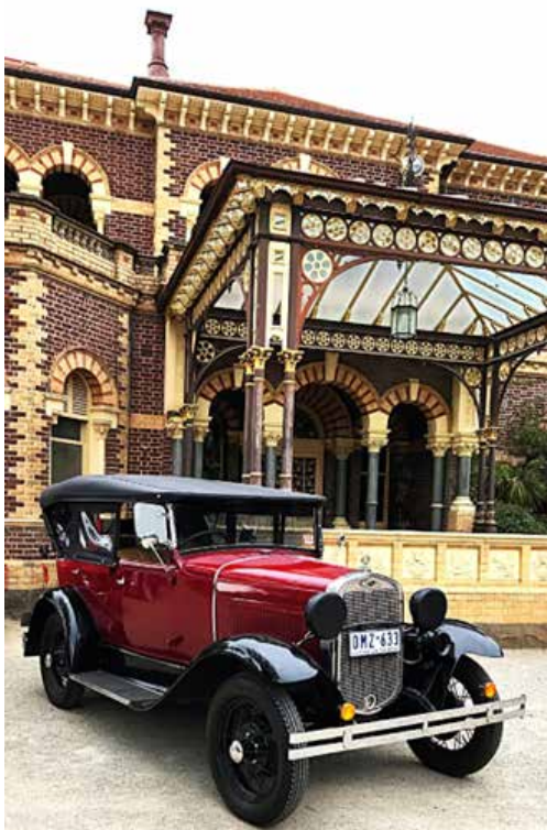
Well suited to the mansion was Stan S.'s Model A Ford.