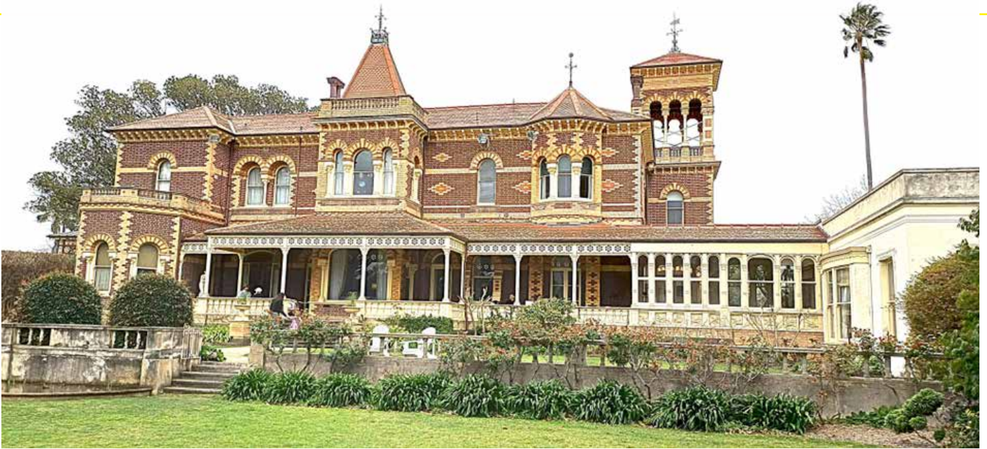
Ripponlea Mansion was originally built in 1868 with 15 rooms but has been added to over the years to 33 rooms