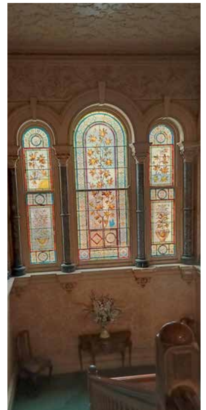
One of the magnificent stain glass windows.