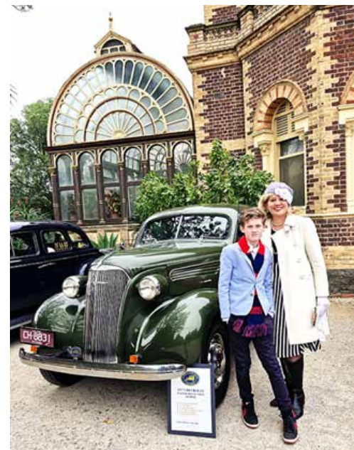
Dressed to kill for the day were these two who loved Ian C.s car.