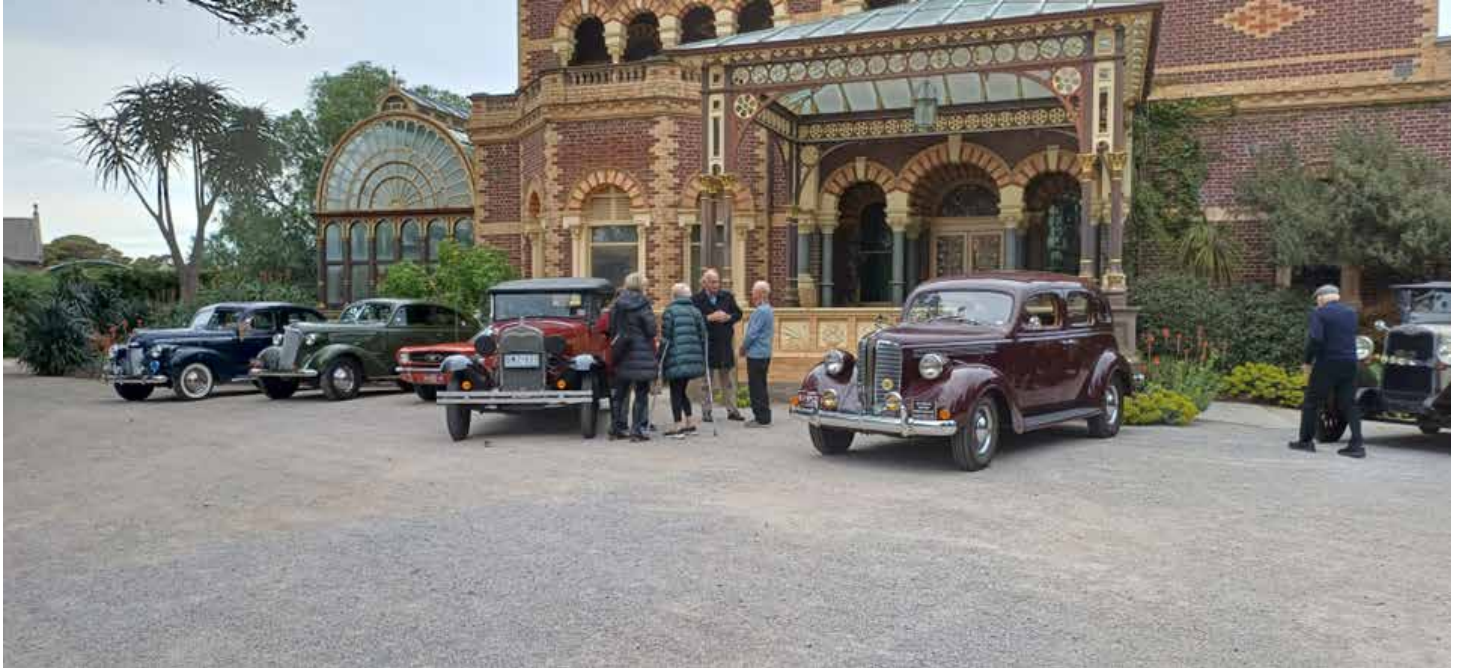
What a great setting for a 1940's movie.