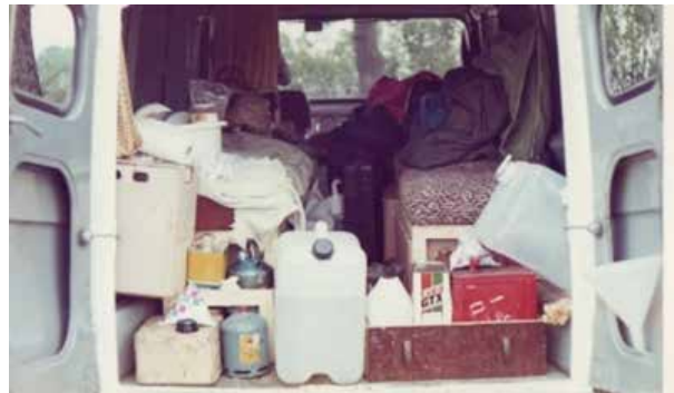
Top right..The inside of their van.