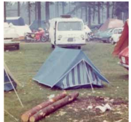
Camping at Nurburgring circuit.....>